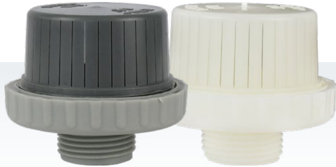
NOZZLE P5 - ID10